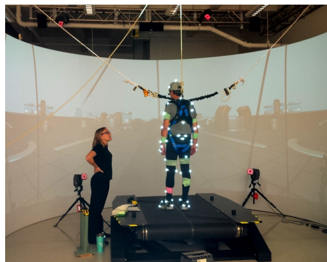
Figure 1: An example image of the research study performed in the laboratory. The participant is standing on a dual-belt treadmill and wearing 54 reflective markers that are being captured by 12 surrounding cameras.

A 12 camera Motion Analysis System collected kinematic data from 54 reflective markers placed on anatomical landmarks of the body. The V-gait treadmill system by Motek Medical containing 2 separate force plates mounted underneath each belt was used to deliver surface translations and record force data (Figure 1).